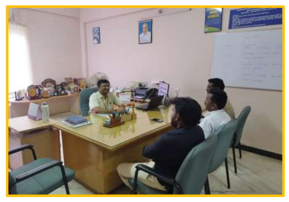
Photo: Alumnus of Sudharsan Engineering College were interacted with Principal Sir