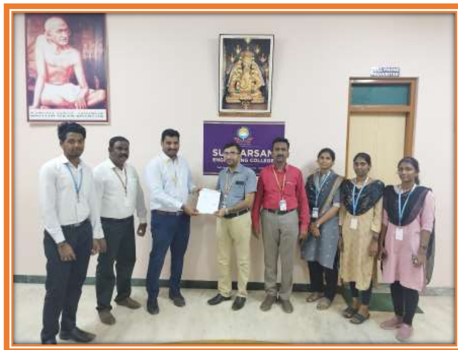
Photo 9 HR provide student's offer letter to Principal.