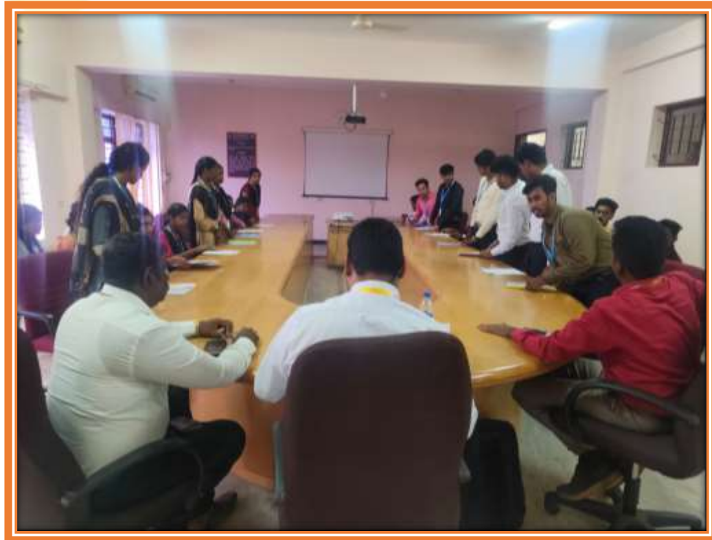
Photo 7: Second Round –Group Discussion

We Revolutionize Engineering & Technology Learning