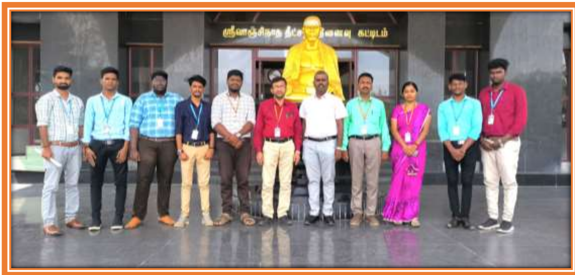
Photo 3 Principal, HR of REDIMIX, Placement coordinator and civil faculty members with Selected Students

Overall, PR READYMIX campus recruitment drive was a success, with six students securing employment opportunities. Congratulations to the selected students!