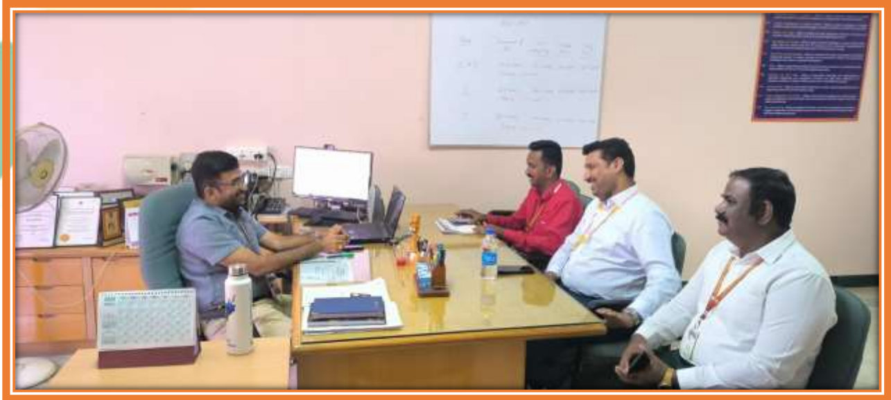
Photo 5 Principal Sir Interacts with Clazy works Technologies CEO.

We Revolutionize Engineering & Technology Learning