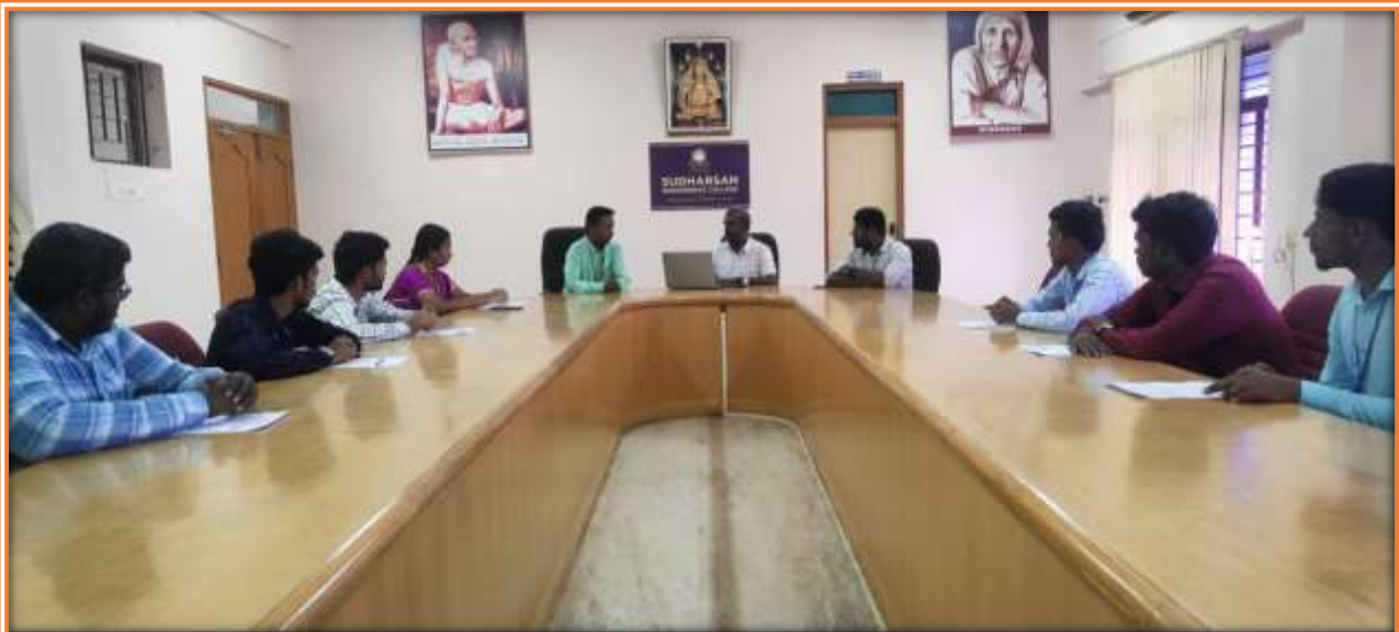
Photo 2 HR of PR REDIMIX gives introduction about the company