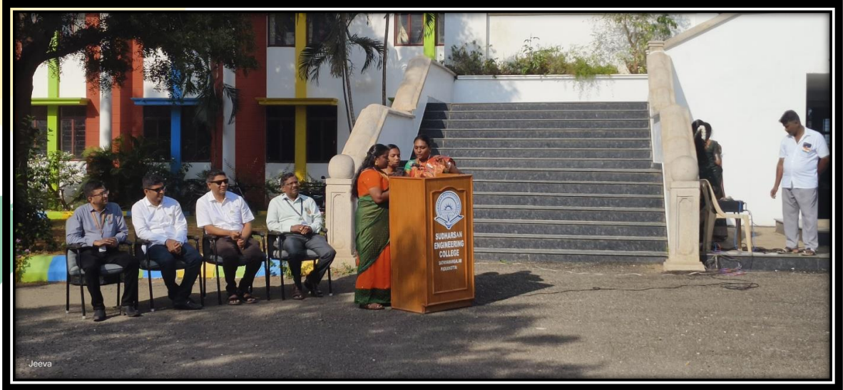
Photo : Faculty Members singing patriotic songs.