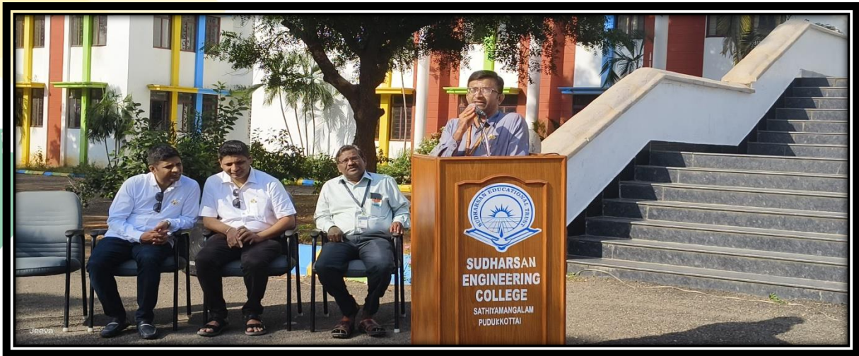
Photo: Principal welcoming the gathering.