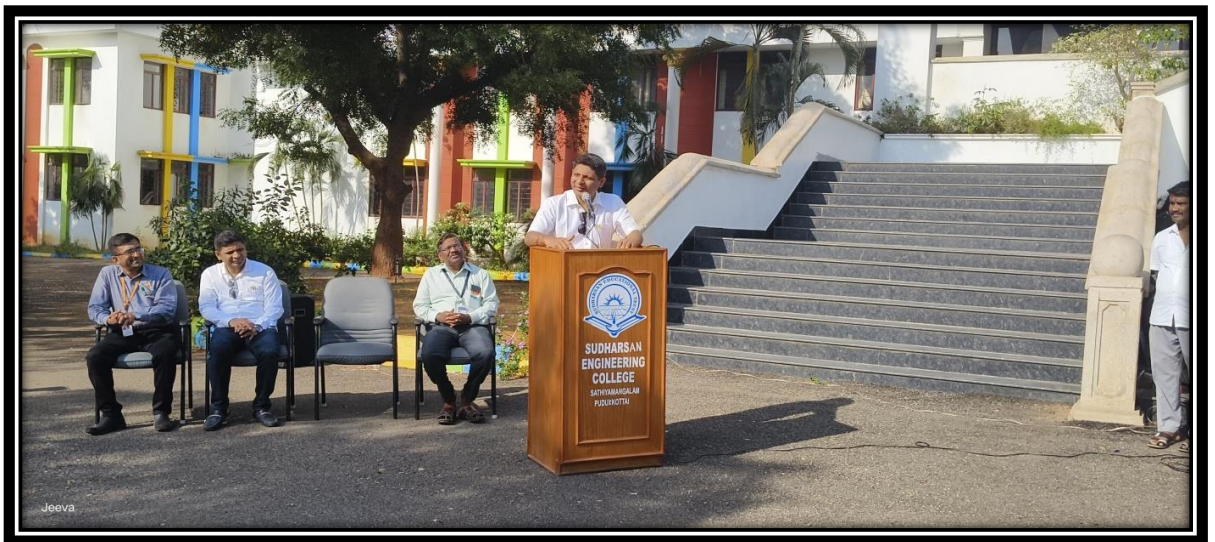
Photo : Chairman delivering the Republic day address